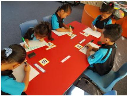
Room 10 learners were learning to write their letters on whiteboards.