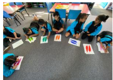
We are learning about our Kakahu.