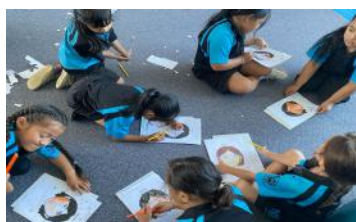
I am learning about how I can show my emotions by expressing my feelings.