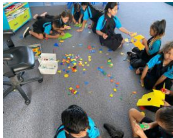
We are cutting out shapes.