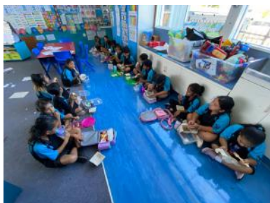
Room 10 enjoying their lunch.