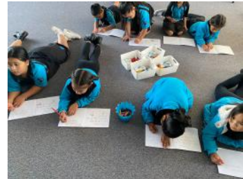
We are learning to write simple sentences about the book we read.