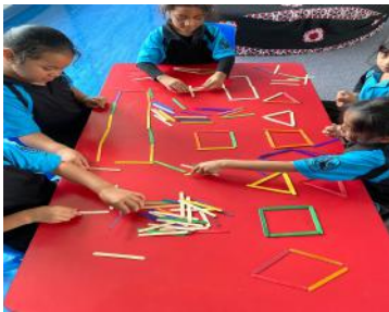
We are making shapes using ice cream sticks.