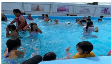
Room 10 splashing in the pool and having fun.