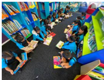
We visit the school library every Tuesday.