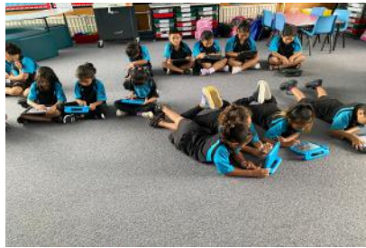
Room 10 are digitally literate learners.